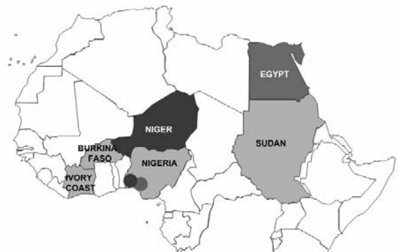
Figure 2. Northern equatorial Africa. Only countries where highly pathogenic avian influenza A (H5N1) sequences from avian species are available are named. Strain similarities are indicated as follows: black for countries with cluster A strains, dark gray for countries with cluster B strains, and light gray for countries with cluster C strains.

Although migratory birds in Egypt and a sparrowhawk ( Accipiter nisus ) in Côte d'Ivoire were reported to be infected by H5N1 viruses ( http://www.oie.int ), this study is the first, to our knowledge, to describe the molecular characterization of HPAI (H5N1) viruses detected in African wild birds. We show that the H5N1 strains from northern Nigeria, Burkina Faso, Côte d'Ivoire, and Sudan probably evolved from a common ancestor. The vector of this transmission has not been identified. Virus transmission from domestic to wild birds has rarely been observed (5,6), but it appears to be a likely scenario since vultures feed on dead poultry and since during the same time (March 2006) an outbreak of HPAI (H5N1) occurred in an intensive farming system ( http://www.oie.int/ ) in Ouagadougou, where infected vultures were also found. Moreover, the virus strains obtained from chickens and vultures in Ouagadougou are phylogenetically similar, as previously described. Hundreds of these birds can be observed around sites such as abattoirs or market places (7). Their feeding behavior could facilitate transmission within domestic poultry, and they could be involved in